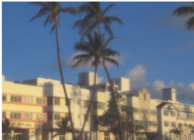
The following are trademarks or registered trademarks of Trane: Trane, the Trane logo, Tracer Summit, and CenTraVac.